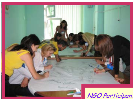
NGO Participants work on an in-class exercise during Week I of the Educational Program.